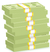
Base Cover ₹10L

Challenges don't stop, and neither should your coverage. Restore your coverage as many times as needed in a policy year for both related and unrelated illnesses, providing unlimited care for you and your family.