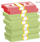
First Claim of ₹2L